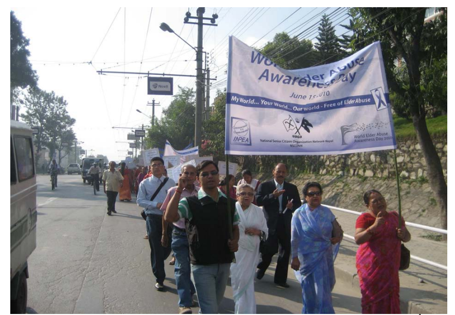
Elders on Street March Shouting Slogans with Banners, Kathmandu, 15<sup>th</sup> June, 2010.