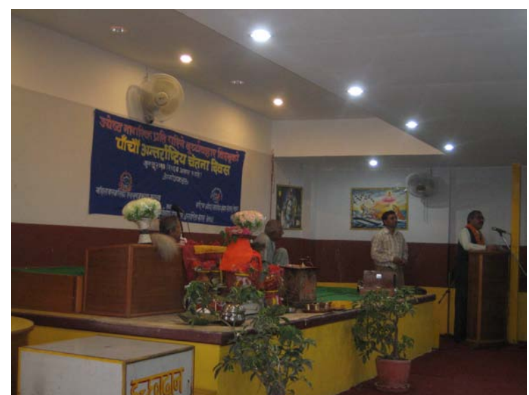
Hon'ble Minister of Women, Children and Social Welfare, Mr. Sarwadev Prasad Ojha Speaking on Fifth WEAAD Interaction Program at GCN

Hon'ble Minister Sarwadev Prasad Ojha, speaking on the occasion expressed his commitments to: a) expedite the process of providing Identity Cards to all Senior Citizens, and, b) put up in the coming Ministerial Cabinet Meting the suggestions received from different organizations for amendments of the existing Acts and Regulations. He reiterated full cooperation of the government for programs related to welfare of senior citizens. He also informed of the government policy decision to work together not only with NGOs but also with the private sector in addressing different issues concerning ageing population.