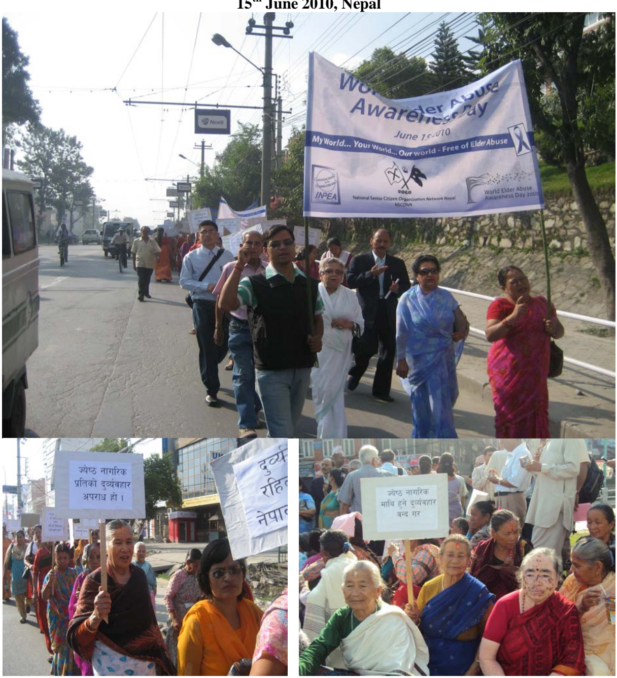
Process Documentation of Fifth World Elder Abuse Awareness Day 15<sup>th</sup> June 2010, Nepal