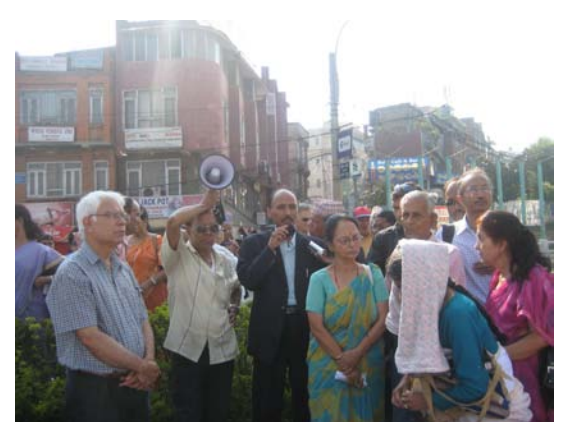
Secretary to the Ministry of Women, Children and Social Welfare Addressing the Mass Meeting

• Hon'ble Minister for MoWCSW as the Chief Guest inaugurated the Interaction Program organized at GCN by watering a plant. The commitments he made on the occasion are presented as content of his speech under section 2.10 of this report.